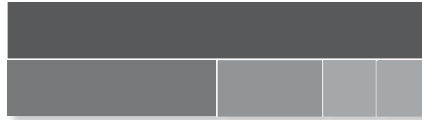
Fraction Strip #1