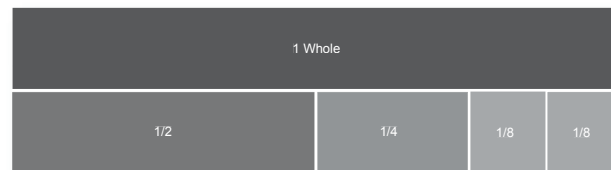
Fraction Strip #1