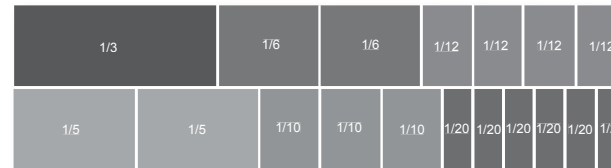
Fraction Strip #2